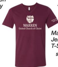
Jersey is the new lighter weight t-shirt.