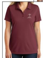
Maroon Men's Polo Shirt

Check must accompany order form and be payable to Warren United Church of Christ.