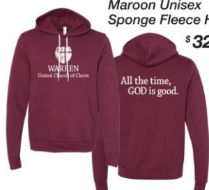
Maroon Unisex Sponge Fleece Hoodie