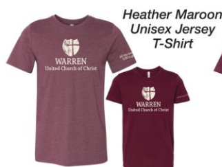
Heather Maroon Unisex Jersey T-Shirt

Orders due by Sunday, September 15, 2019